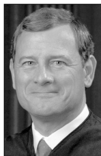
John G. Roberts, Jr. Chief Justice of the United States

born Jan. 27, 1955, Buffalo, NY raised Long Beach, IN appointed from MD