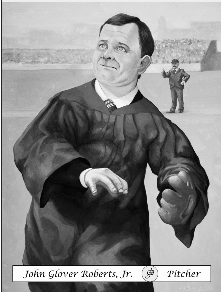
John Glover Roberts, Jr.

Supreme Court Sluggers ♦ October Term 2009