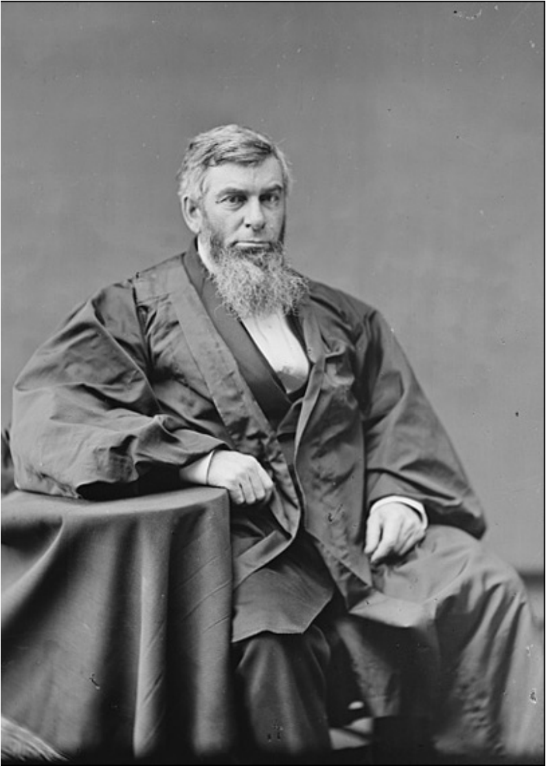
Morrison R. Waite.

In 1874, President Ulysses Grant unexpectedly selected Morrison Remick Waite, a lawyer from Ohio, to be Chief Justice of the United States. Waite served as Chief Justice for 14 years. He was still