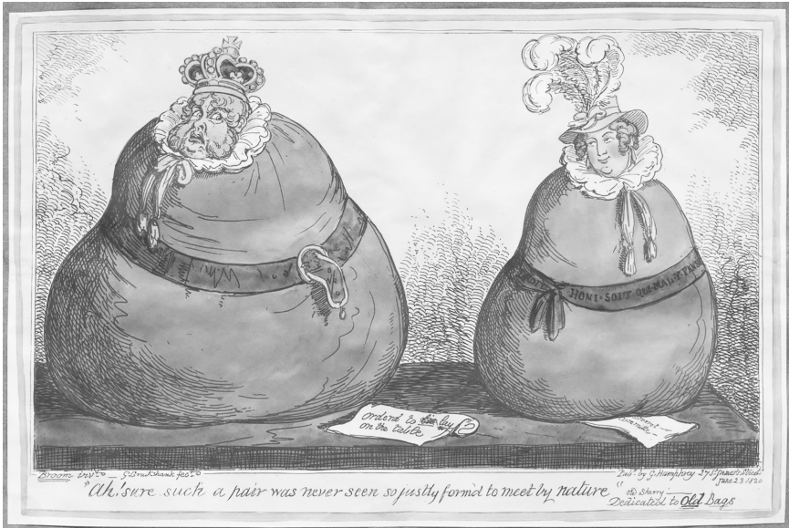
Figure 3. Title: "Ah! sure such a pair was never seen so justly form'd to meet by nature". Creator: George Cruikshank. Source Title: George Humphrey shop album. Identifier: Folio 75 H89 821 (Oversize) http://findit.library.yale.edu/catalog/digcoll:4771969.