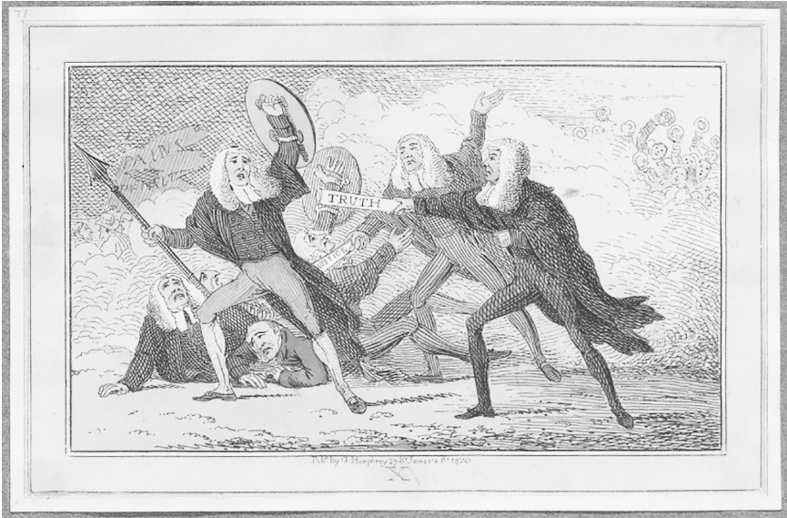
Figure 2. Title: Horrida Bella! Creator: Theodore Lane (?). Source Title: George Humphrey shop album . Contributor: Lewis Walpole Library, Yale University. Identifier: Folio 75 H89 821 (Oversize) https://orbis.library.yale.edu/vwebv/holdingsInfo?bibId=13854493 .

he inserted in italics: “If the King has a Green Bag, the Queen might have one too.” 6 William Cobbett circulated this aphorism, part of what he calls “a string of terrifying hints,” as if spoken by Brougham: the Commons “must, after they have done with the green-bag of the King receive one on the part of the Queen.” 7 George Cruikshank propelled this threat into visual culture with his print, “Ah! Sure such a pair . . .”, (fig.3) published June 23, 1820. In it, a pair of pear-shaped bags, with the king’s and queen’s head topping the larger and smaller respectively, play out the rancorous disagreement signaled by the Milan investigation. The king’s face is turned away from the queen with “terrified fury,” and she regards him with “demure provocation” 8 as her ostrich feathers curl with comic menace toward his