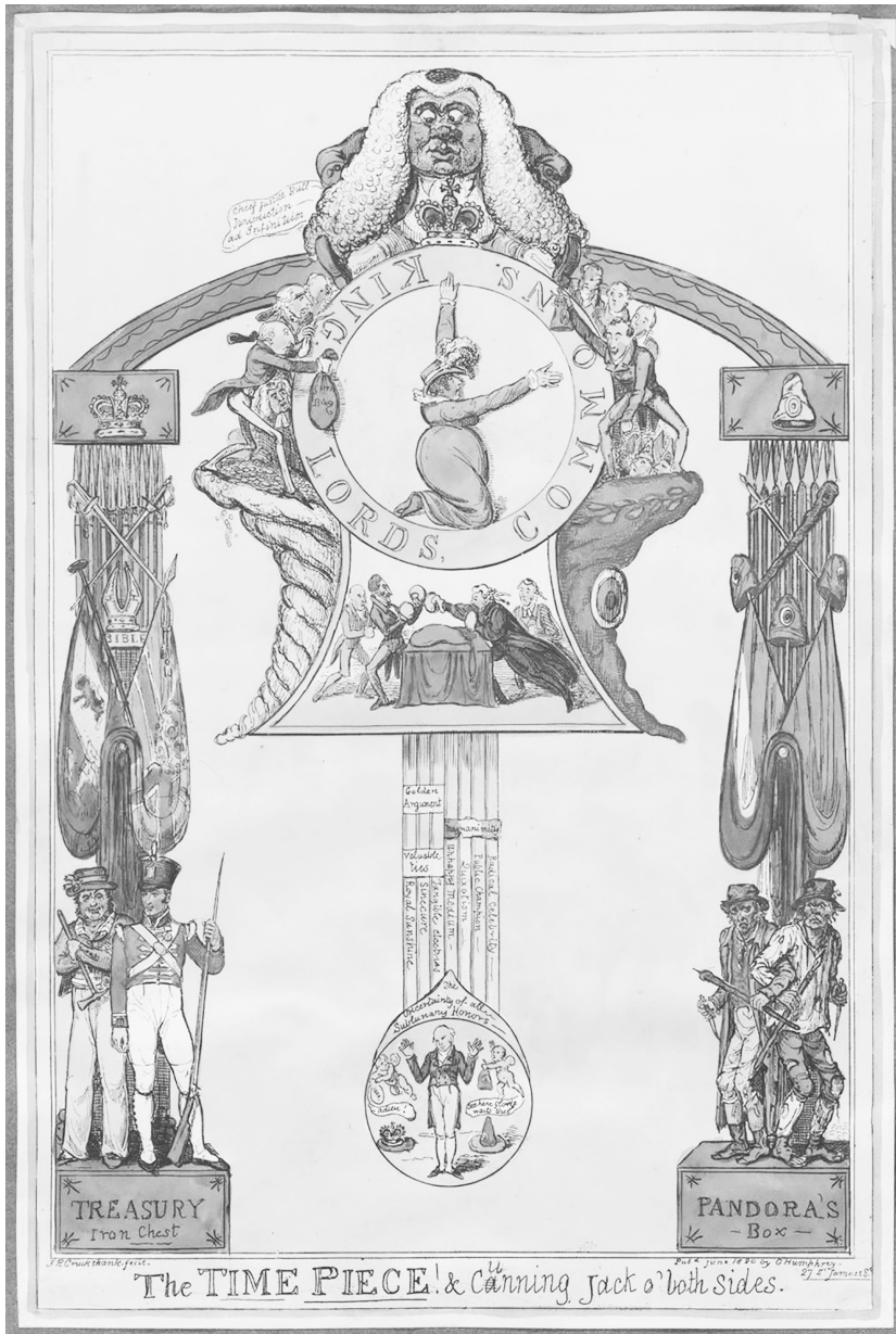
Figure 1. Title: The Time Piece . Creator: Robert Cruikshank. Source Title: George Humphrey shop album. Contributor: Lewis Walpole Library, Yale University. Identifier: Folio 75 H89 821 (Oversize) http://findit.library.yale.edu/catalog/digcoll:4771991 .